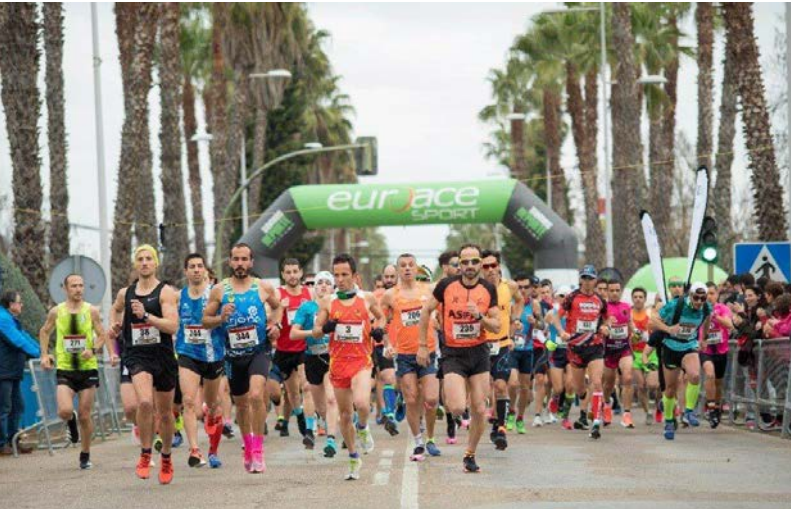
6 partners Lead: Extremadura Avante