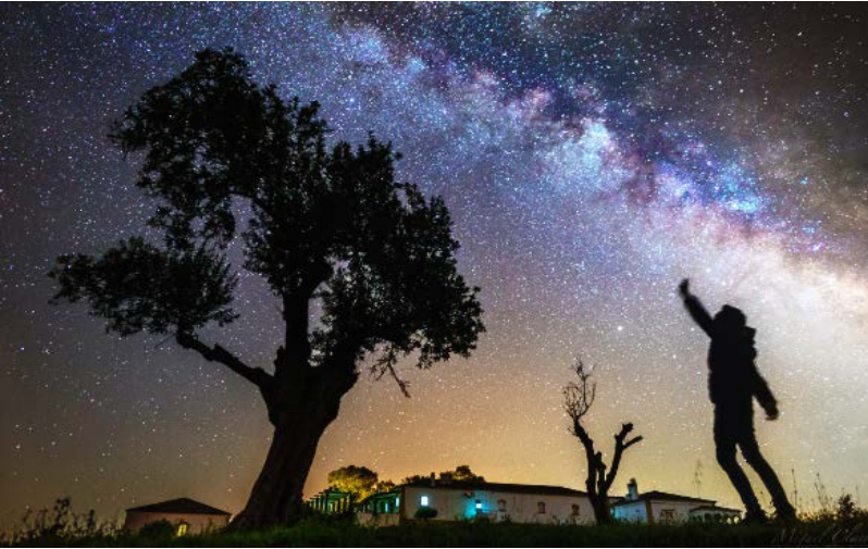
11 Partners | Lead: Associação Transfronteiriça Lago Alqueva (ATLA)